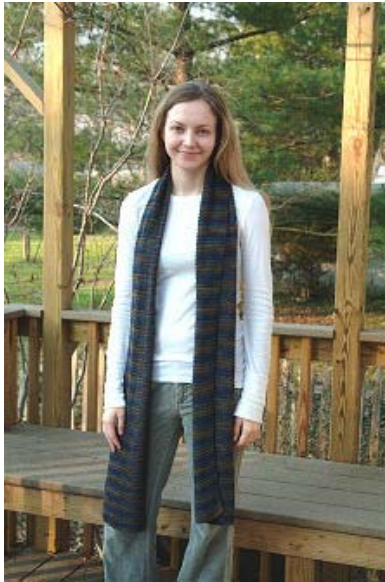
Beaded Rayon Scarf